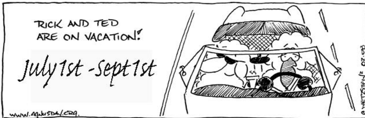
Appears with permission of www.agnusday.org

Lord God, Creator of all things, guide our steps and strengthen our hearts, during these months of summer and vacation days. Grant us refreshment of mind and body. We ask this through Christ our Lord....Amen.